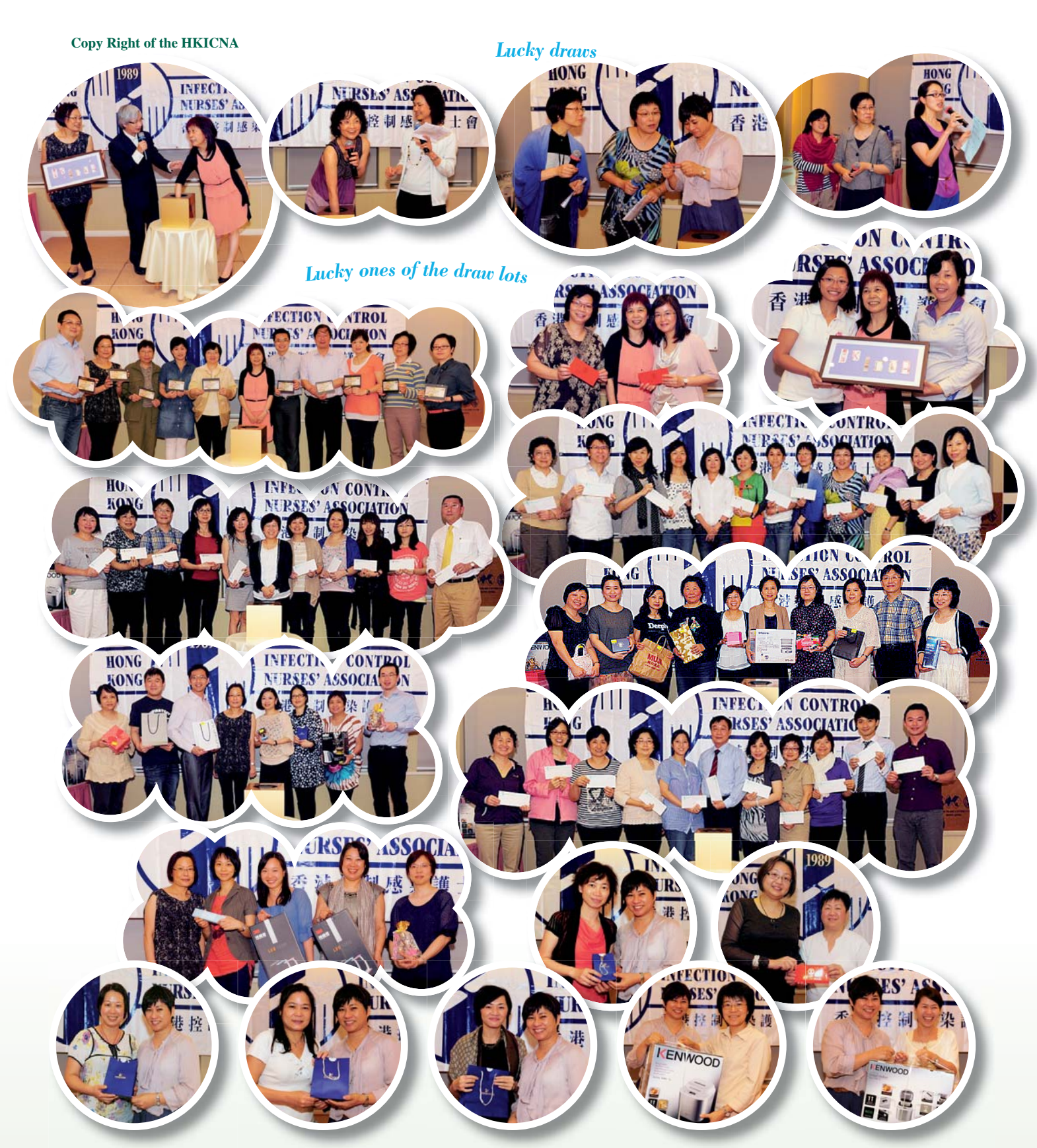
Top 5: Two Sony digital camera 55, Tablet PC, I pad 3, I Phone 4S